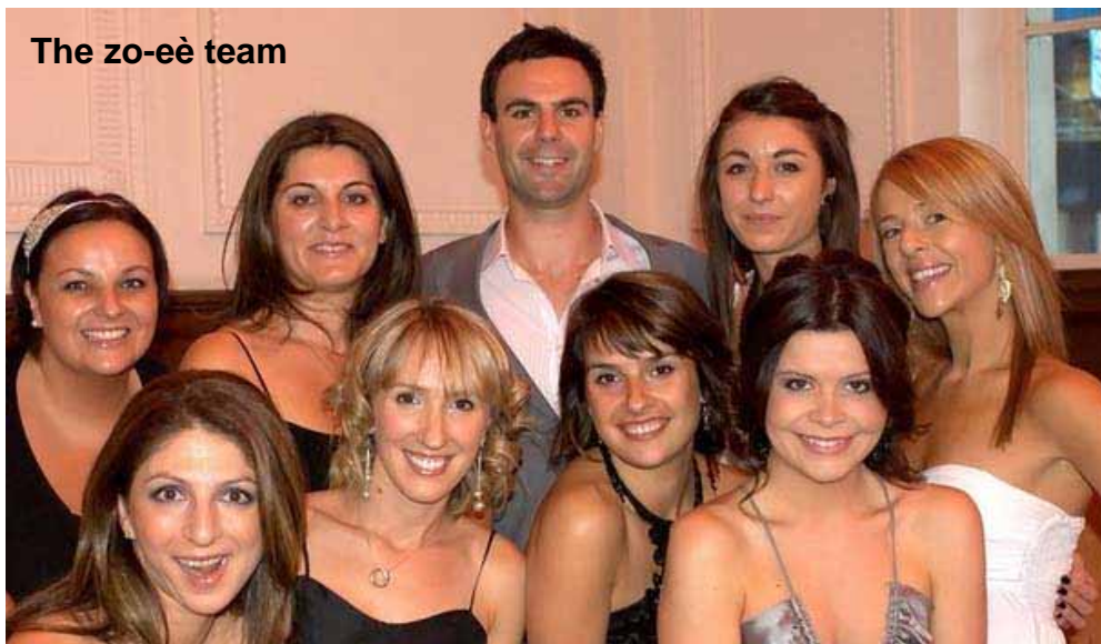
The zo-èè team